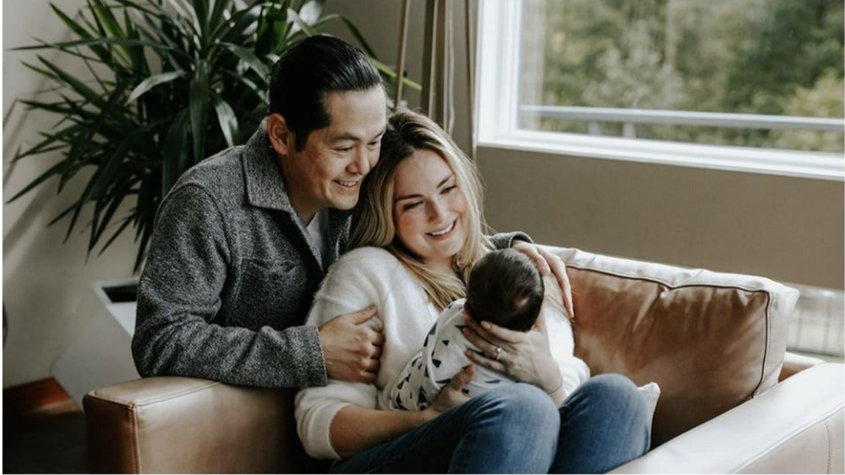
Photos on social media also show more pictures of them in the house at 13376 NW Jackson Quarry Road.