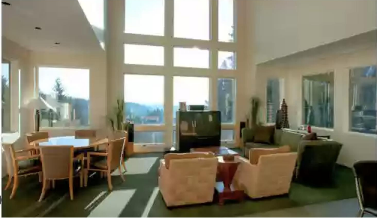
Photos on Hai Pham’s website appear to be at 13376 NW Jackson Quarry Rd. ( Hai for Oregon )